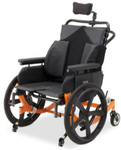
(shown with optional upgrades)