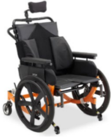
(shown with optional upgrades)