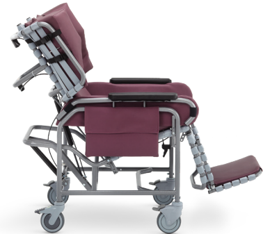
Posterior tilt aids in pressure redistribution