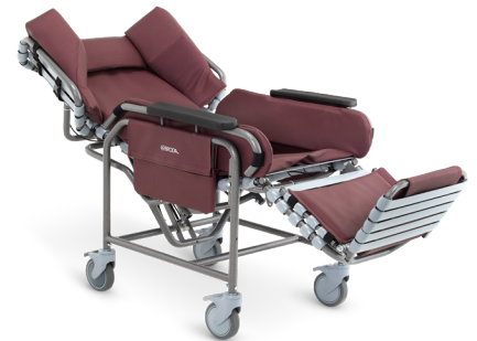
Tilt with semi-recline accommodates hip flexion limitations, allowing patients to be out of bed