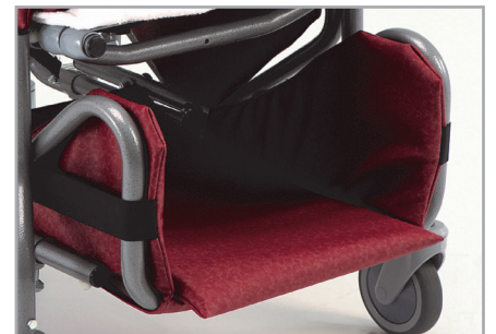
Optional contracture sling accommodates various levels of knee contractures