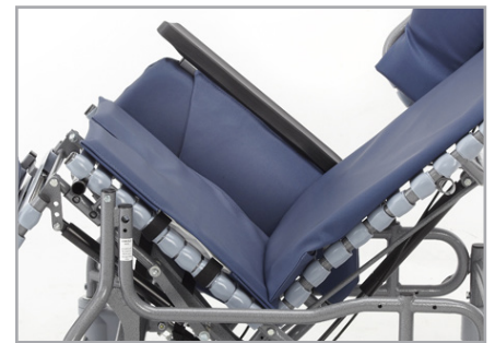
Removable arm supports make transfers safer for caregivers and patients