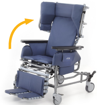
Tilt and recline functionality allow easy repositioning of users