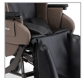
Padded Thigh Strap