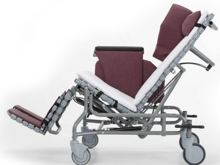
Posterior Tilt effectively opens the diaphragm improving digestion, oxygenation, and organ function