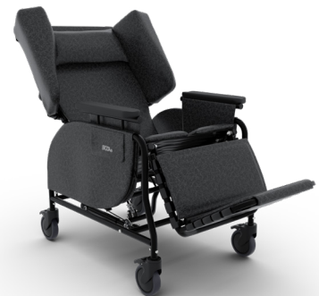
Tilt-in-space enhances comfort