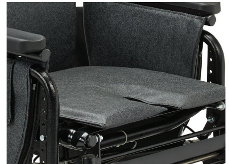
Adjustable seat surface height adapts the Midline to support users at multiple care levels