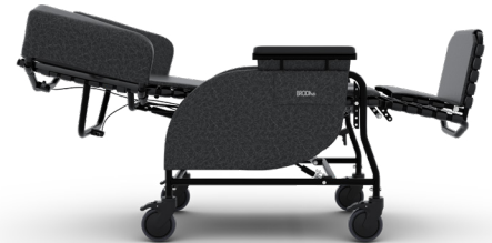
Full tilt and recline functionality provides superior positioning