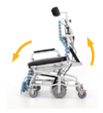
Anterior and posterior tilt allows for easy user positioning