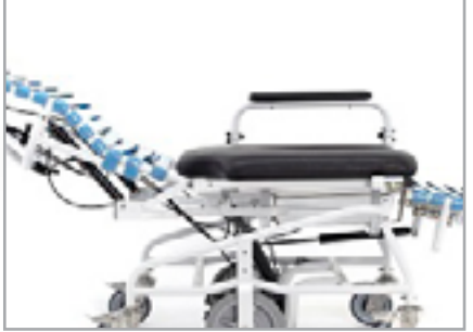
Rust-resistant frame and components are durable and long-lasting