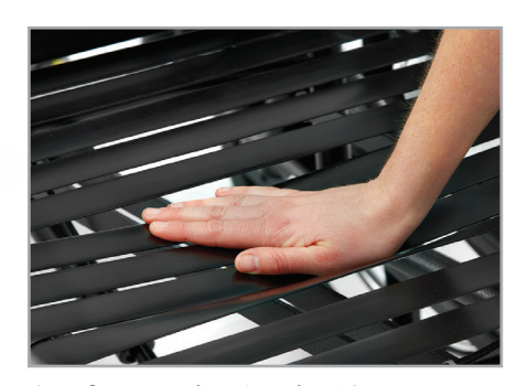
Comfort Tension Seating * improves postural support and sitting tolerance