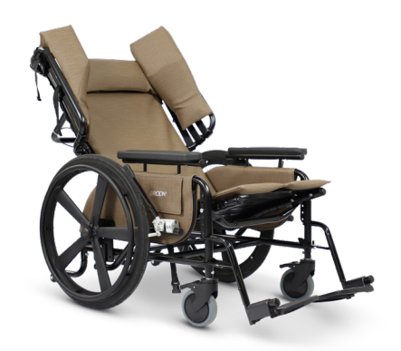
Front-pivot seat tilt maintains user comfort with smooth, effortless tilt