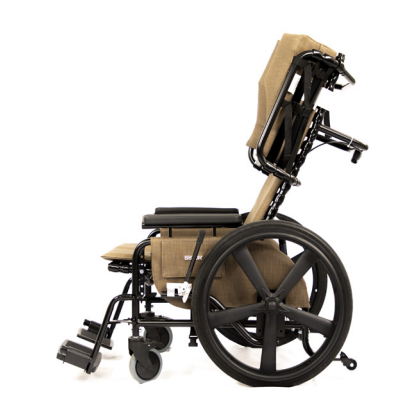
Adjustable seat surface height allows for proper foot propulsion