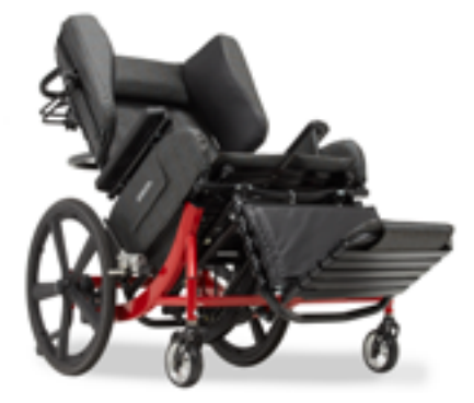
Front-pivot seat tilt maintains a forward line of sight, enhancing engagement.