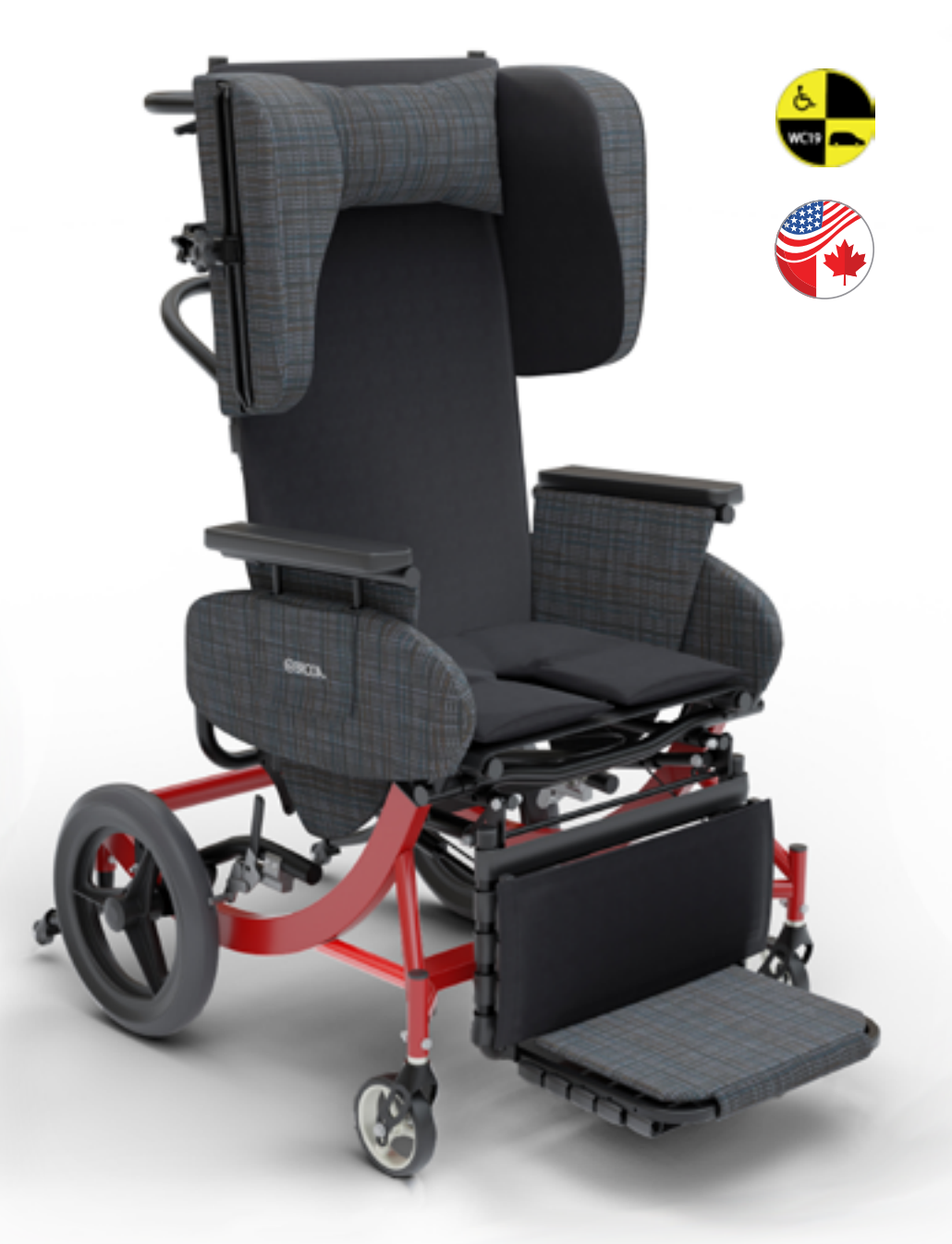
Shown with rear 14" mag wheel option