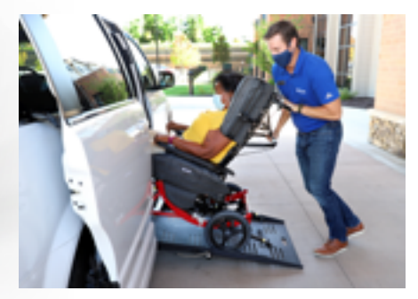
Optional WC-19 Transportation Package enables safe patient travel