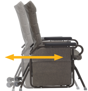
Gentle gliding motion