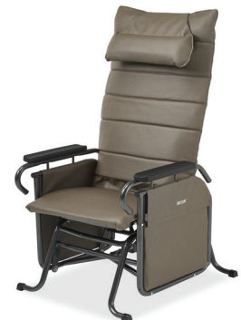
Auto-locking feature increases safety and prevents falls