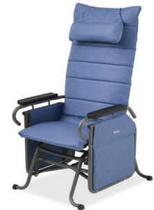
Stimulates active patients and reduces the need to wander